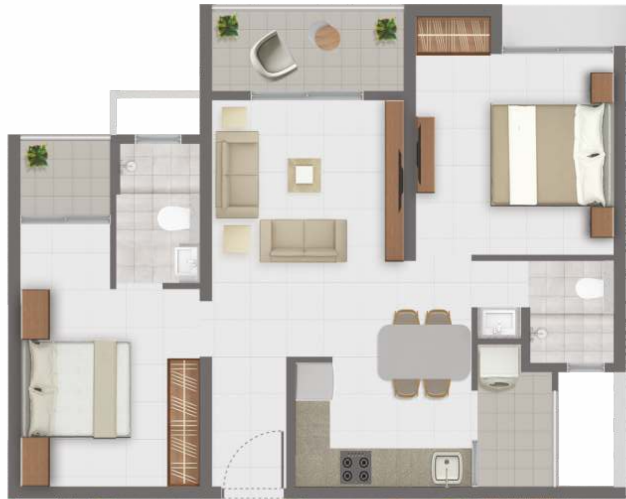
2 BHK Type 2