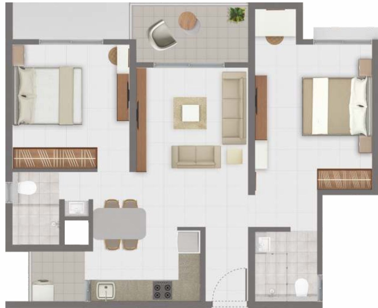
2 BHK Type 3