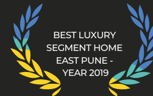
F-Residences by Times Realty Icons