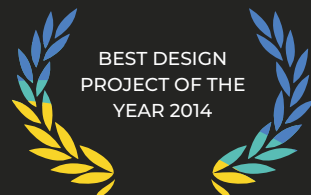
F-Residences by Silicon India