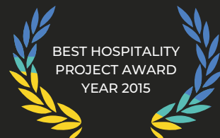
Le Meridien (Mahabaleshwar)