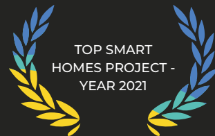
BramhaCorp Smart by Pune Times Mirror Real Estate Icons