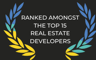
BramhaCorp Ltd. by CRISIL