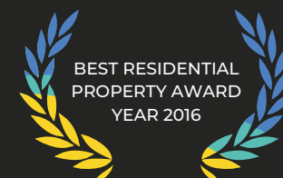
Suncity Platinum by Realty Plus