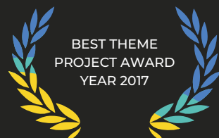
F-Residences by Realty Plus