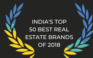
BramhaCorp Ltd. by International Brand Equity