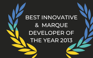
BramhaCorp Ltd. by Estate World