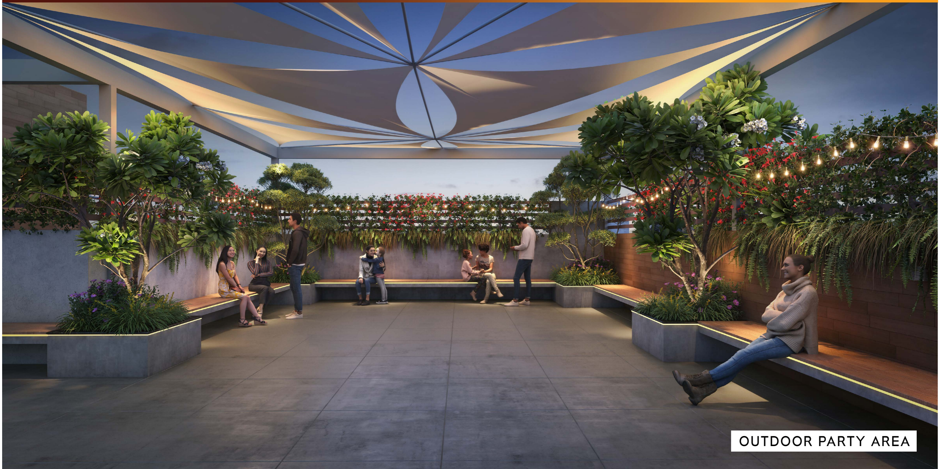
OUTDOOR PARTY AREA