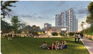
CLUBHOUSE & PARTY LAWN Amenities