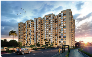
NIIGHT VIEW EMERALD GREEN RESIDENCES

With a well-thought-out design, Emerald Green Residences offers a unique living experience. The building is designed to be a green building, with a focus on natural ventilation and solar shading.