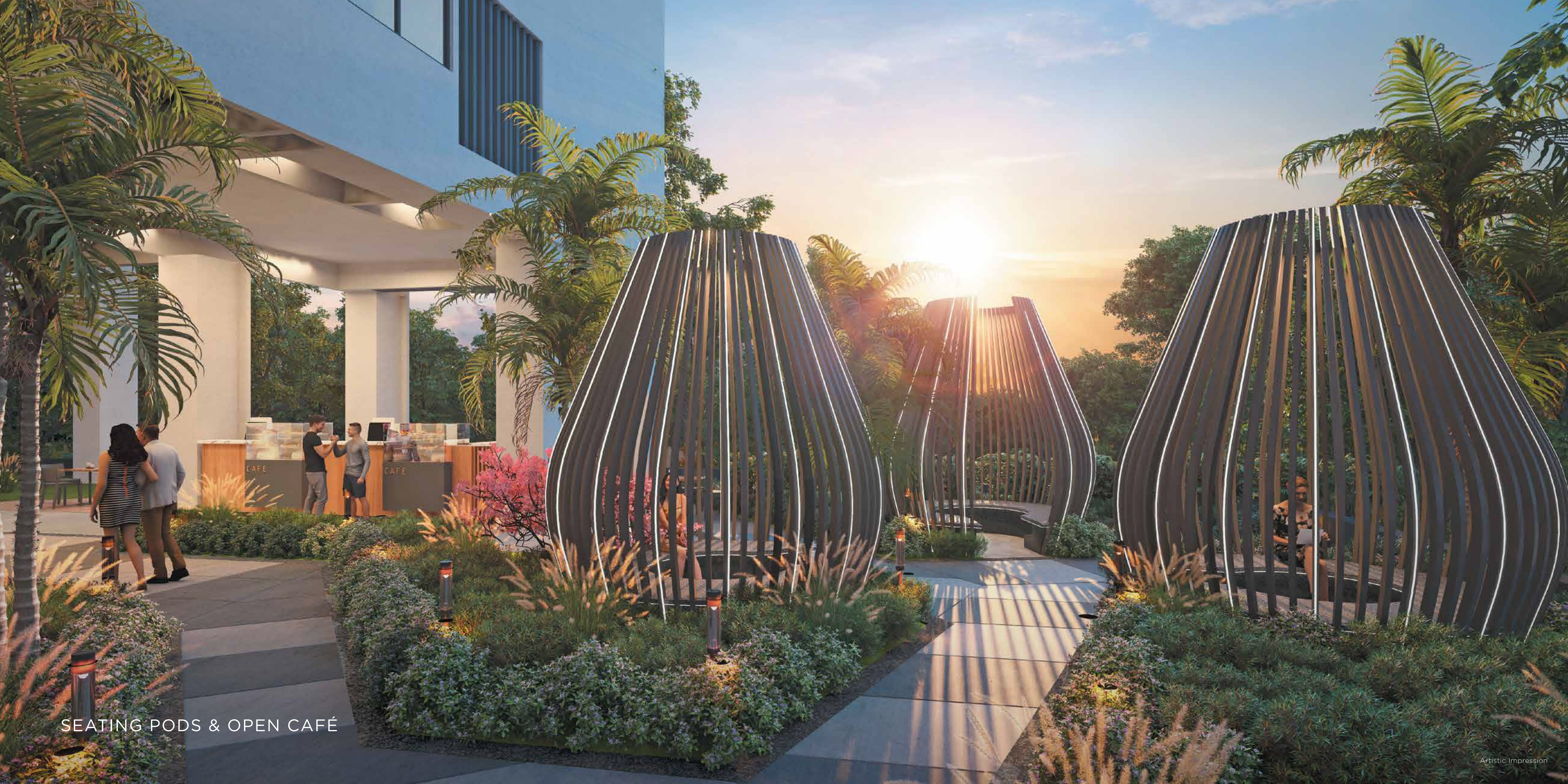
SEATING PODS & OPEN CAFÉ