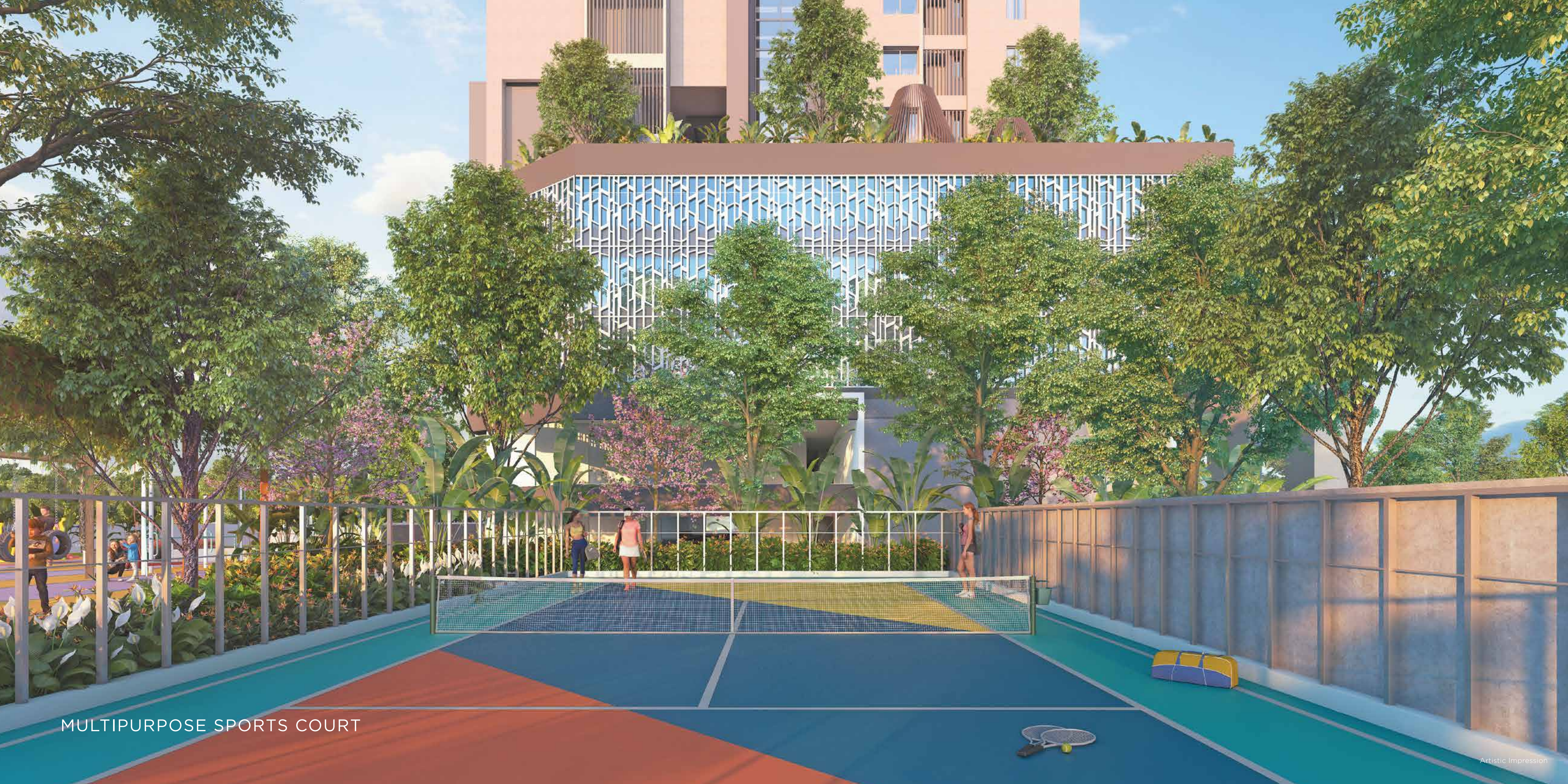
MULTIPURPOSE SPORTS COURT