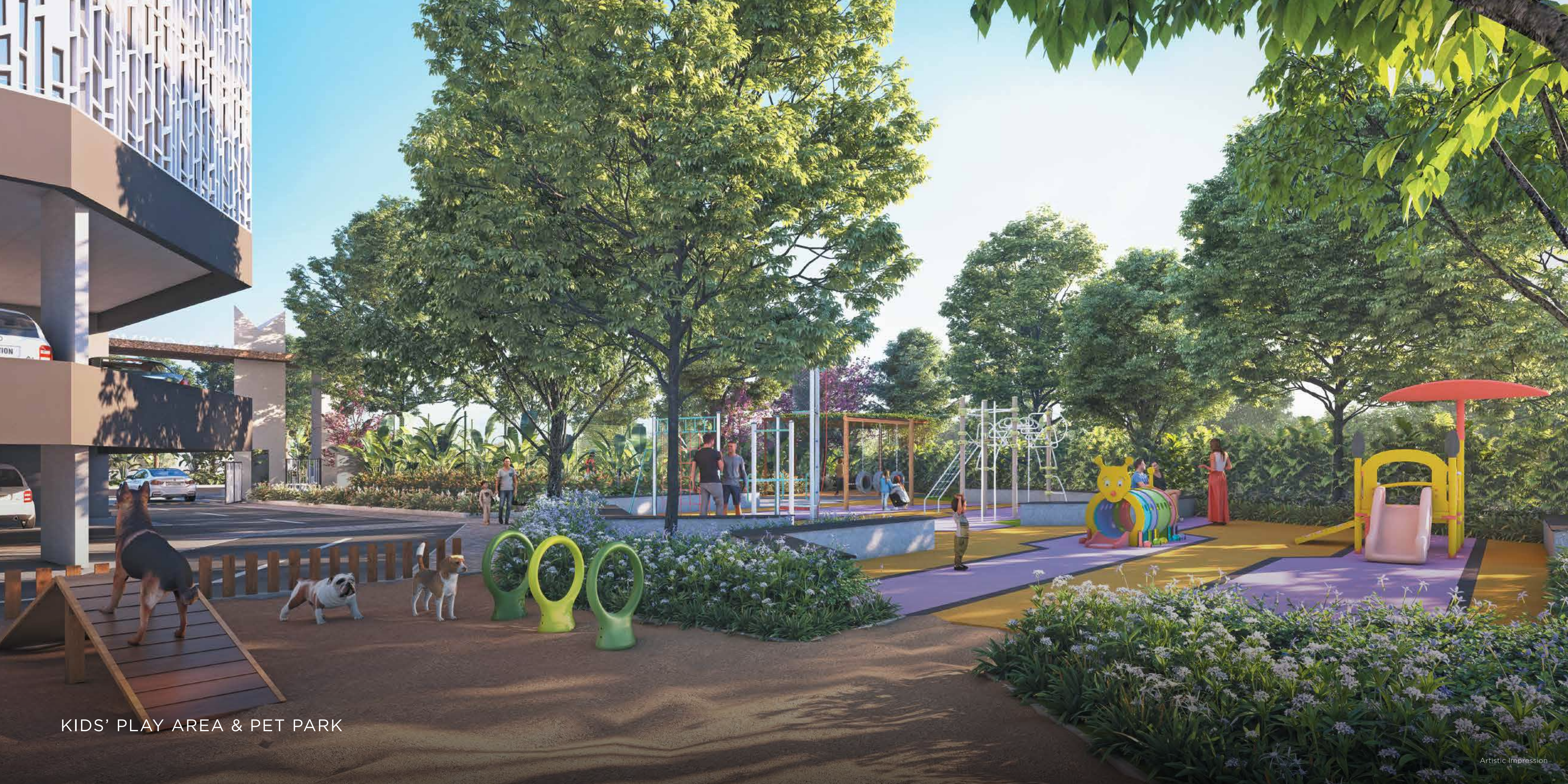
KIDS' PLAY AREA & PET PARK