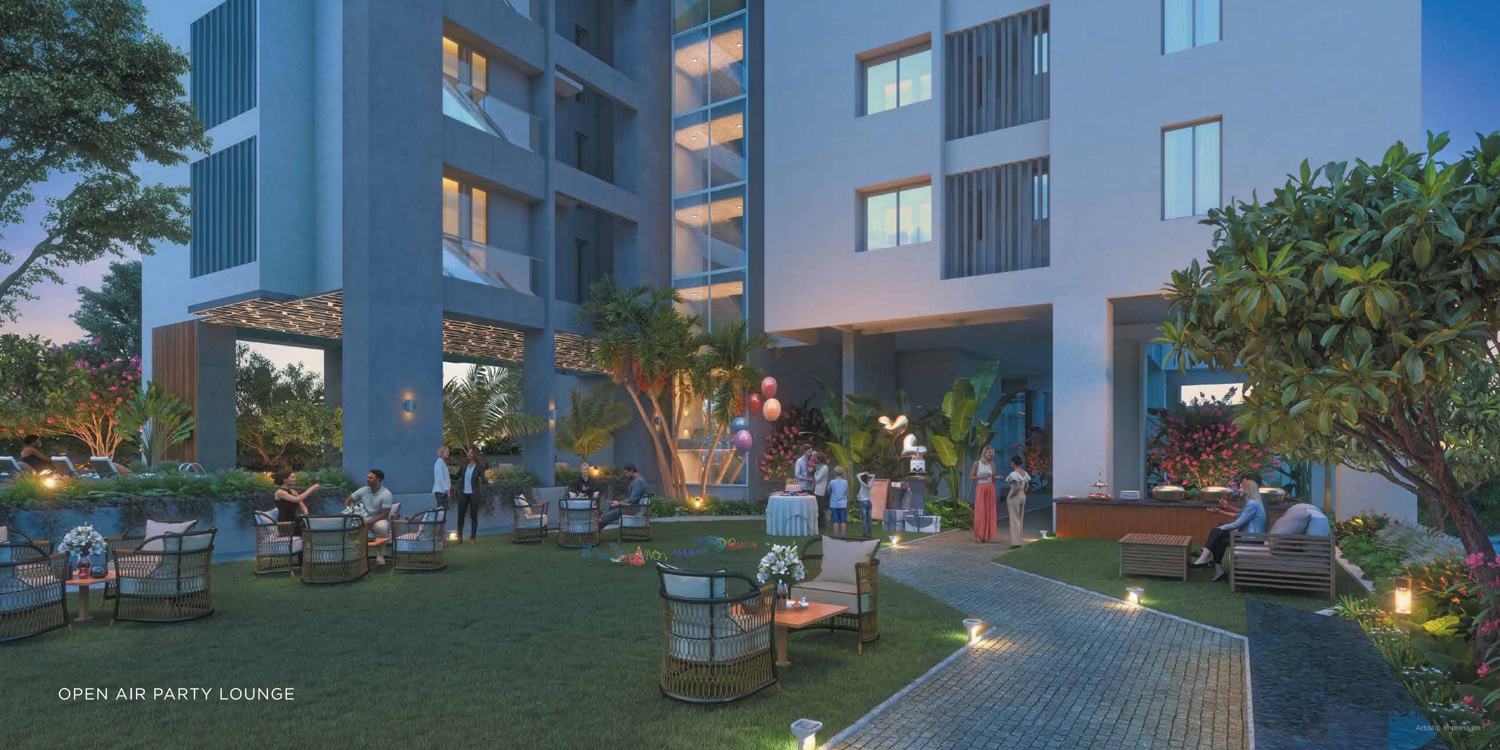
OPEN AIR PARTY LOUNGE