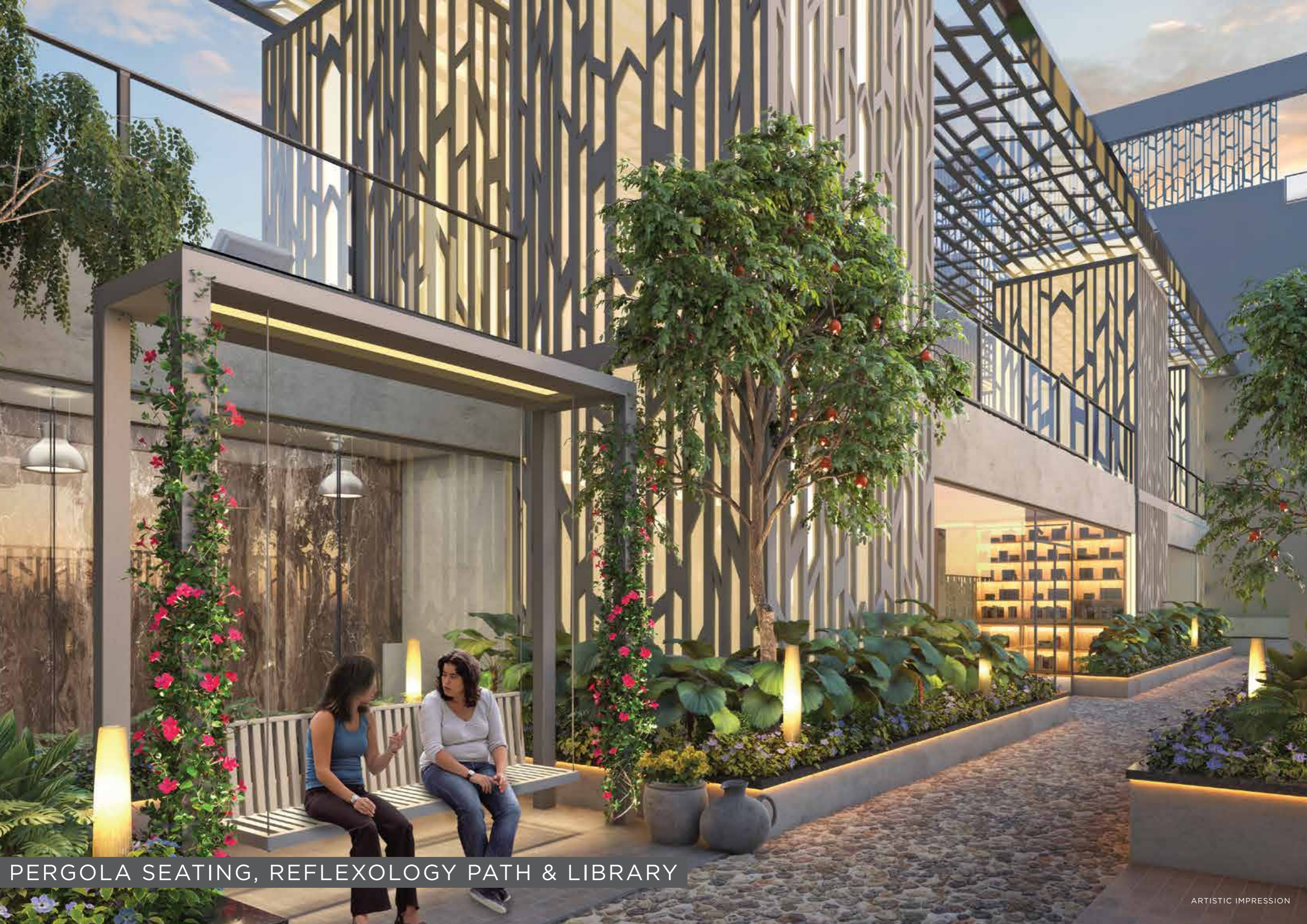
PERGOLA SEATING, REFLEXOLOGY PATH & LIBRARY