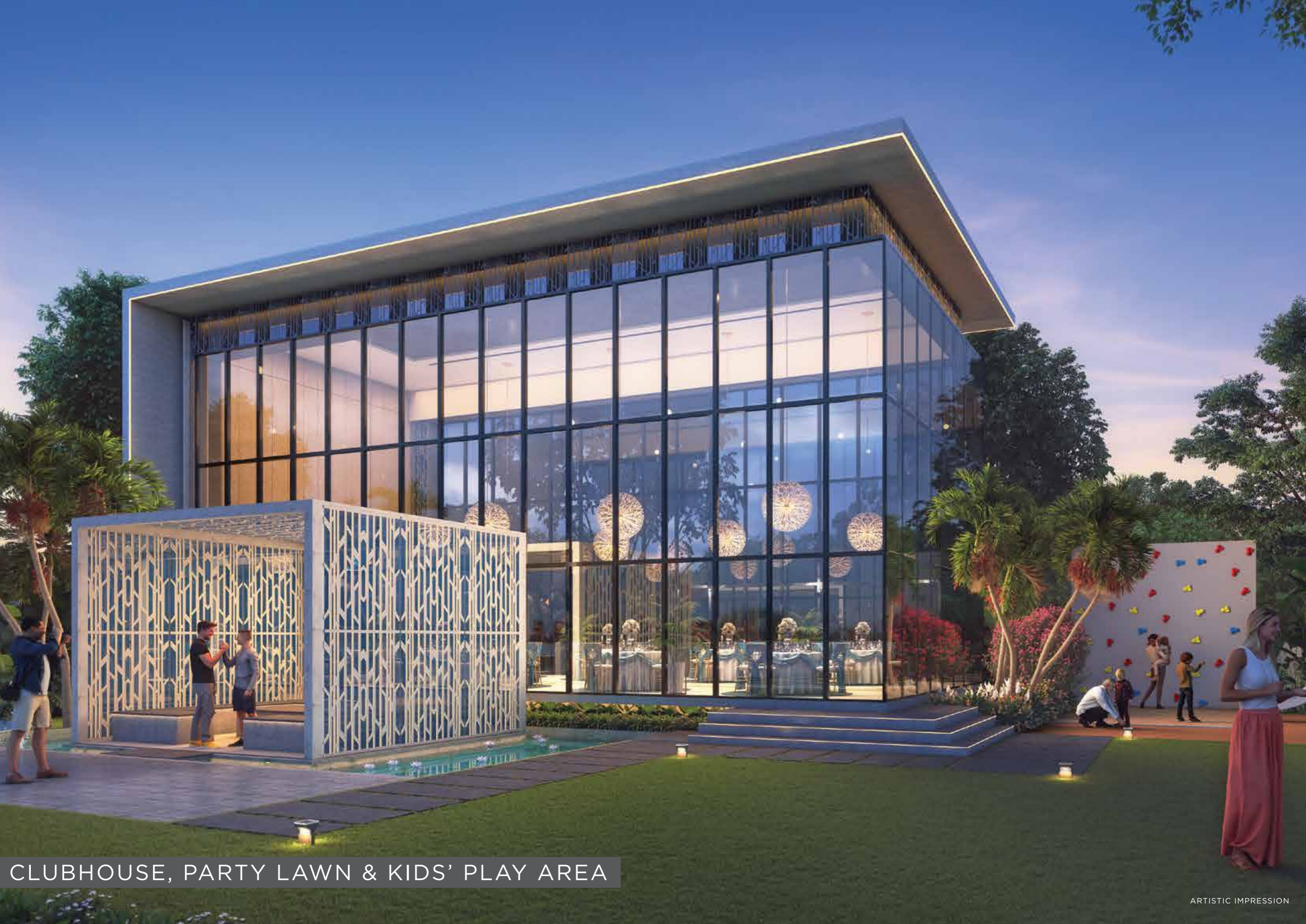
CLUBHOUSE, PARTY LAWN & KIDS' PLAY AREA