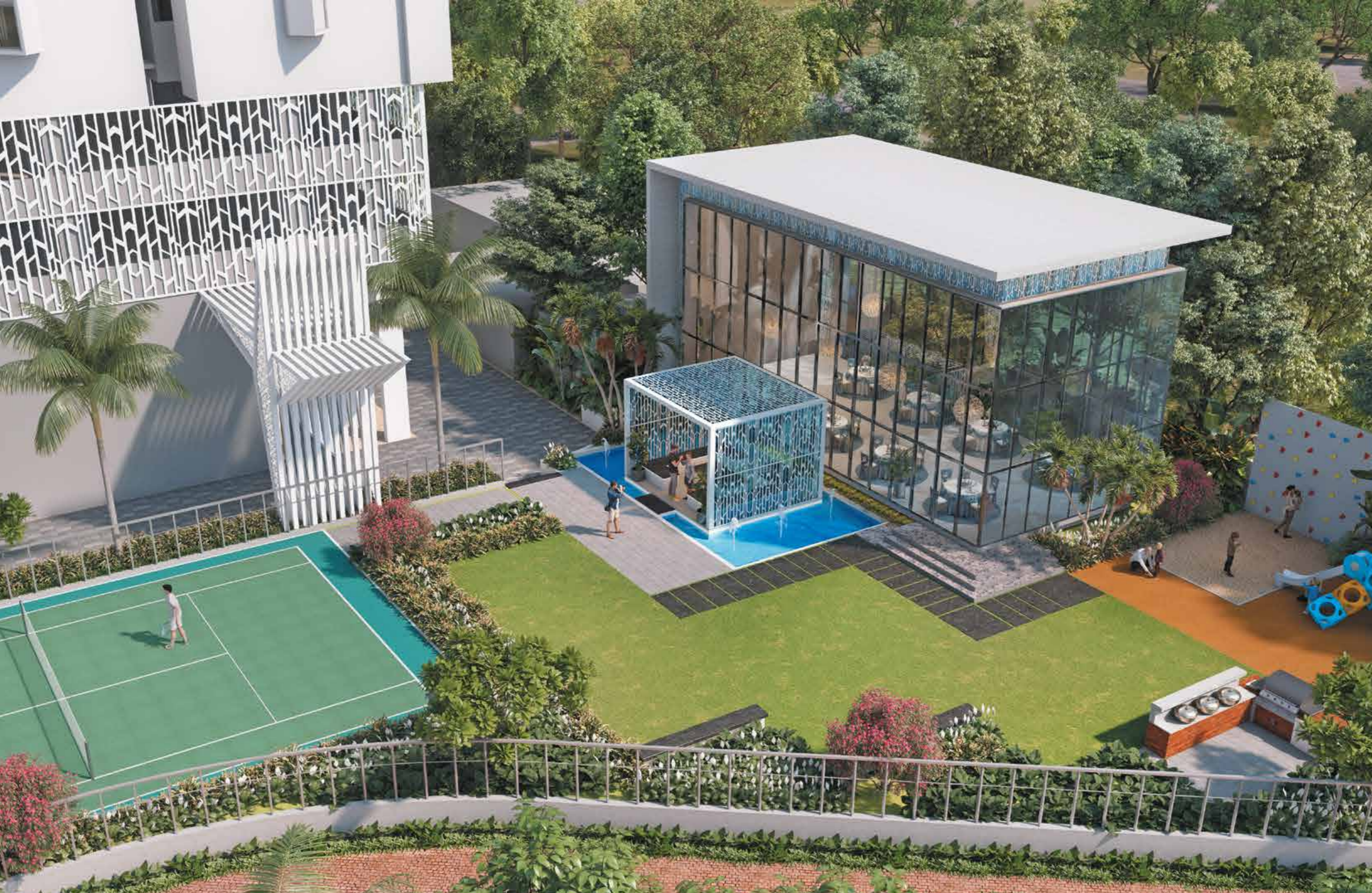
CLUBHOUSE, PARTY LAWN & MULTIPURPOSE SPORTS COURT