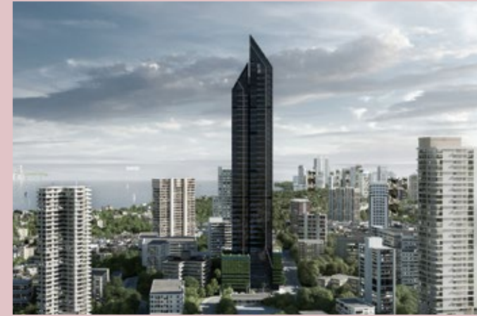
Lodha Altamount India's finest residences on Mumbai's Billionaires' Row

Our ability to deliver scale, our innovative design, superior execution, differentiated branding and marketing, coupled with our efficient and enthusiastic on-ground sales staff, all come together to create the best value for our customers across residential, retail, and office spaces – winning their trust and appreciation time after time.