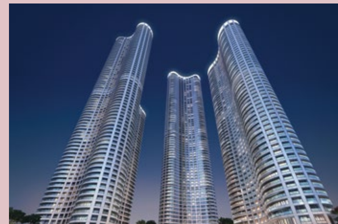
The World Towers One of India's most iconic addresses