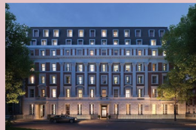
No.1 Grosvenor Square The world's most desirable address