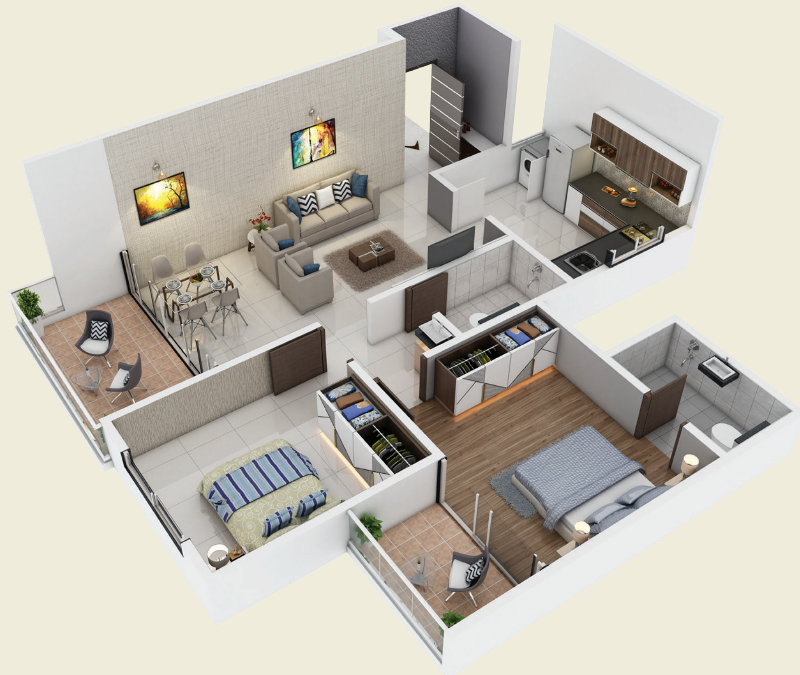
ISOMETRIC VIEW - 2 BHK