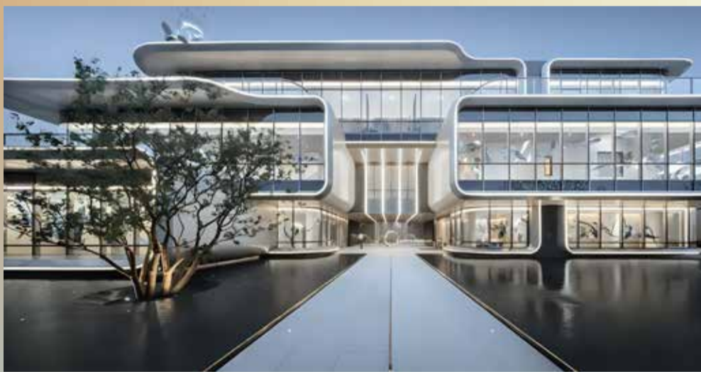
GRAND CLUBHOUSE SPREAD ACROSS 1 LAKH SQ. FT.

IN AN ALL-ENCOMPASSING ECOSYSTEM OF 150 ACRES