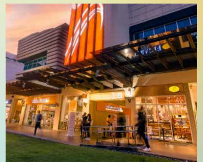
GLOBAL HIGH STREET WITH MANY AVENUES OF ENTERTAINMENT