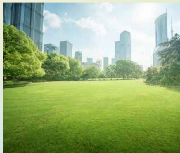
CENTRAL GREENS EXTENDING OVER 26 ACRES