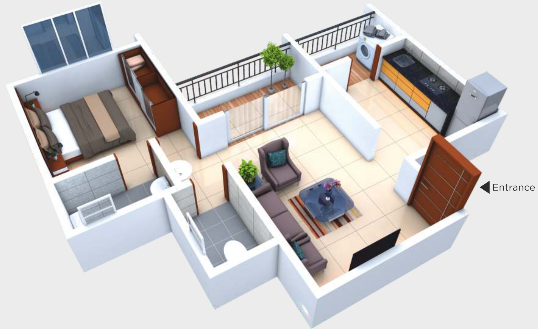
1 BHK Cut Section View