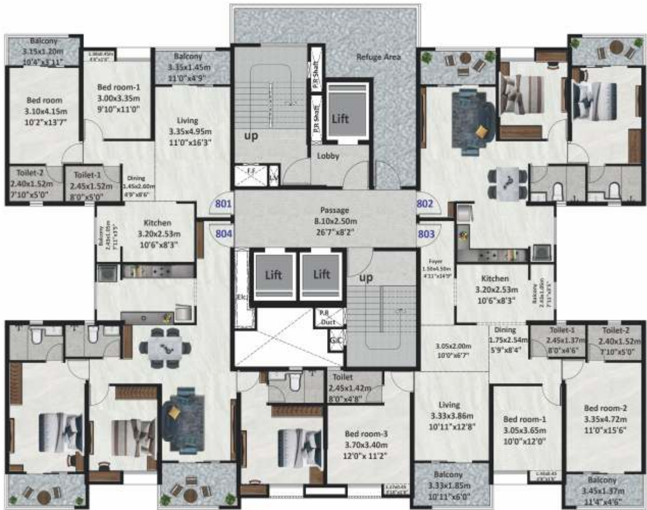
TYPICAL 8 TH , 13 TH , 18 TH , 23 RD , 28 TH FLOOR PLAN

MahaRERA No: Nyati Emerald I: P52100051235