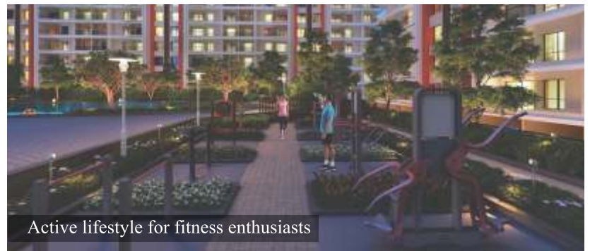
Active lifestyle for fitness enthusiasts