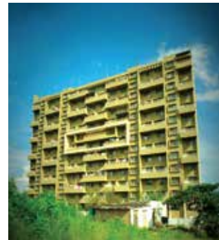
HONEYDEW Pirangut Annexe