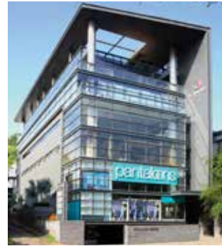
ACHALARE HOUSE Baner