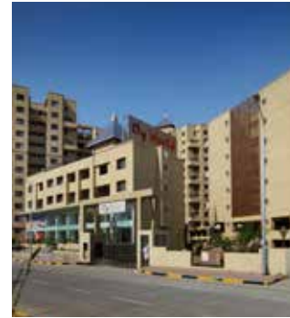
MY WORLD Baner