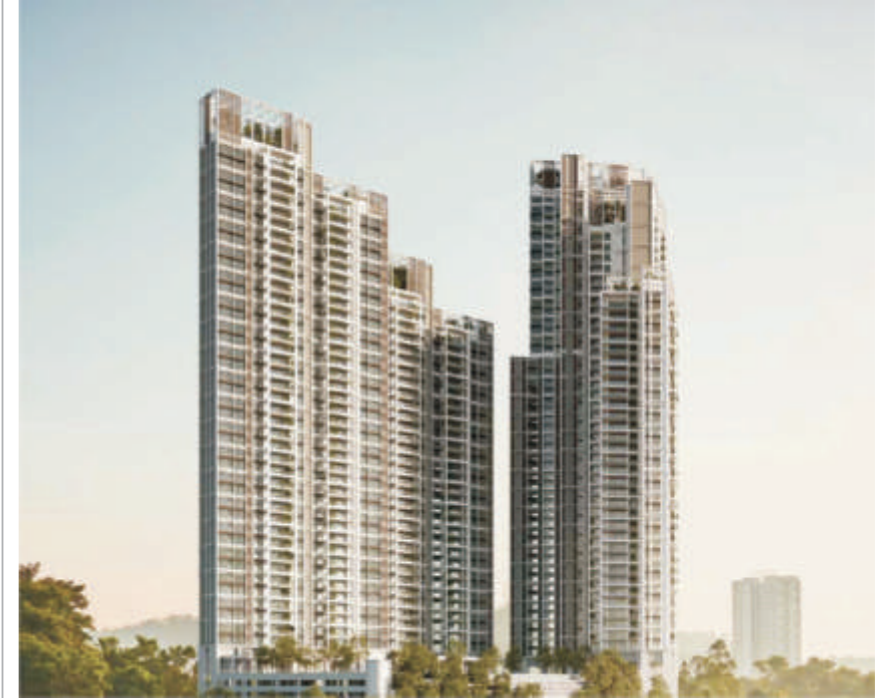
PRIMAL GALAXY 2 & 3 BHK Comfort Homes MOSHI