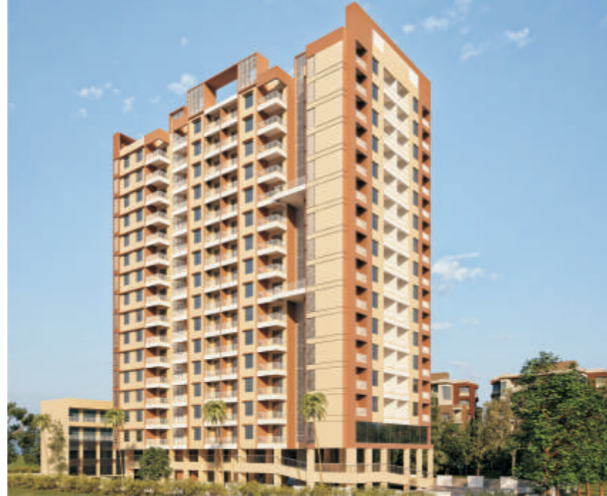
PRIMAL MARIGOLD 2 & 3 BHK Spacious Homes MOSHI