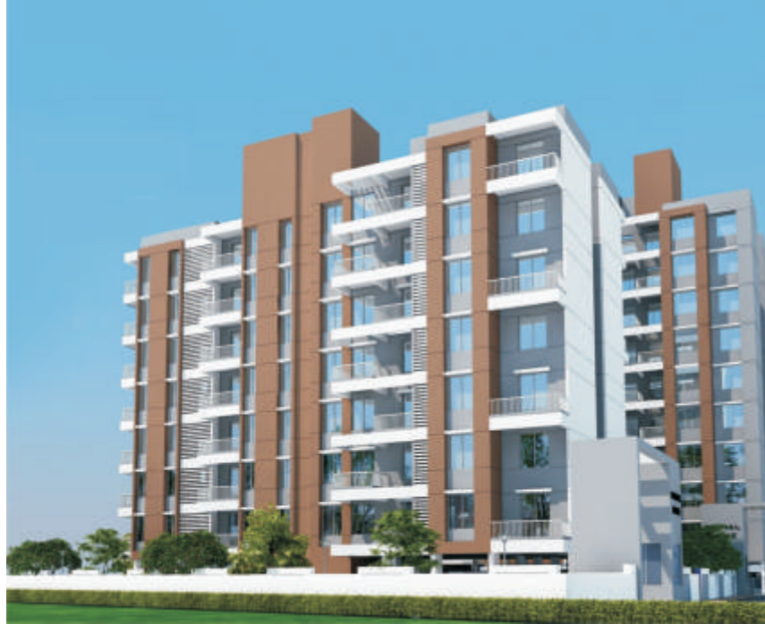
PRIMAL HOMES 1 & 2 BHK Cosy Homes MOSHI