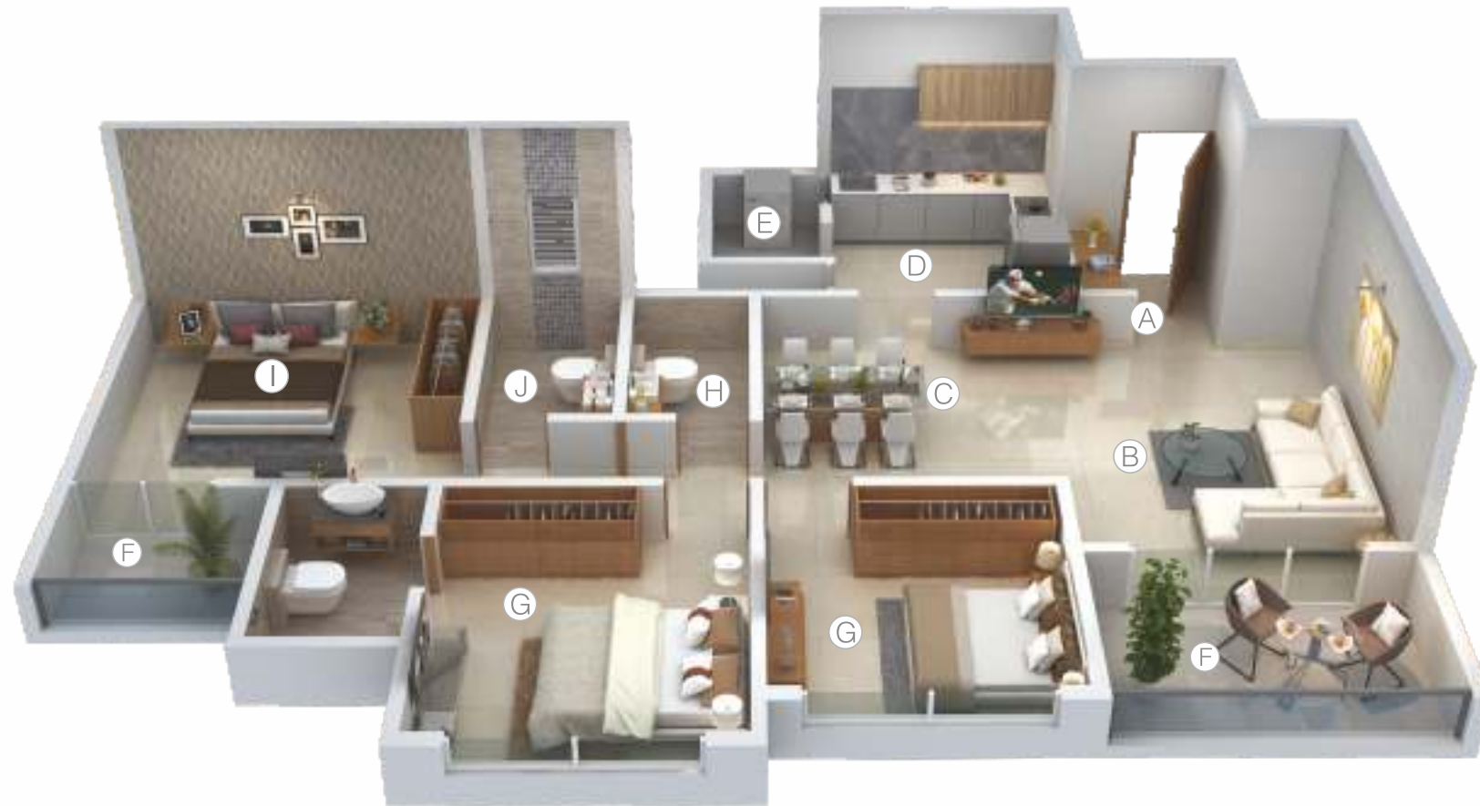
3 BHK Apartment