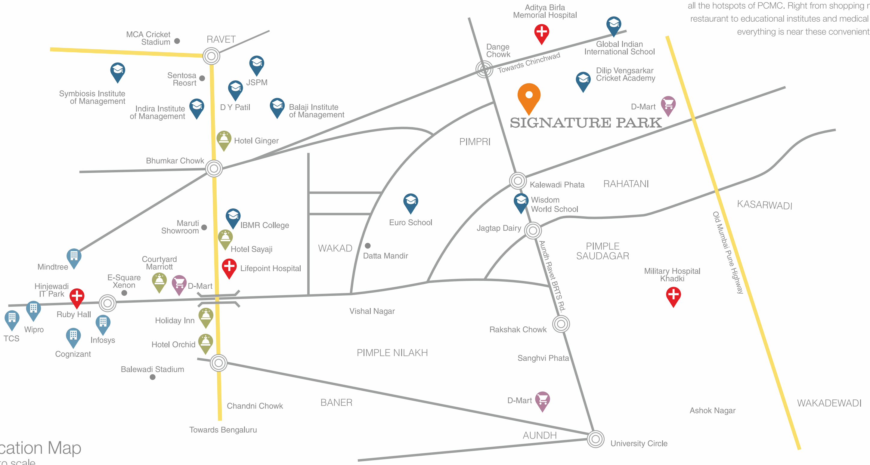
Location Map Not to scale