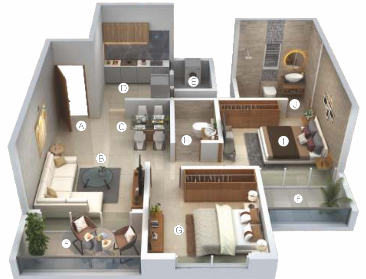
2 BHK Apartment